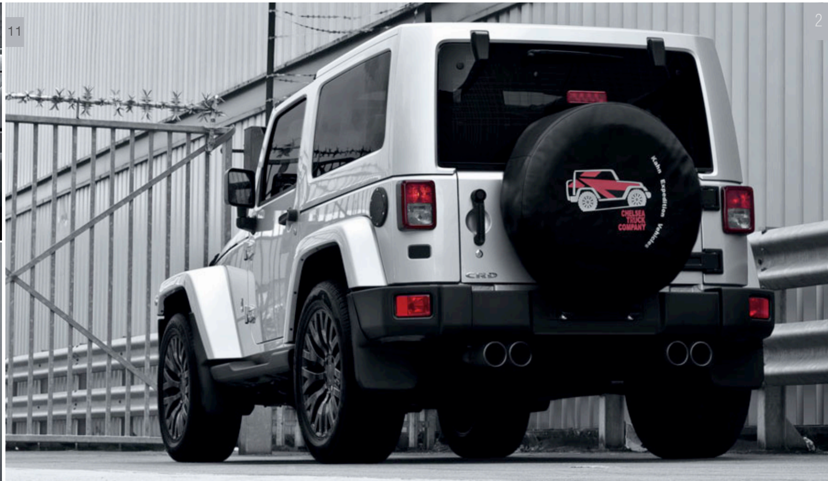
IMAGE 11 SHOWS HARD TOP IN BODY COLOUR (ONLY AVAILABLE WHEN ORDERING NEW VEHICLE) FUEL FILLER CAP IN MATT BLACK STAINLESS STEEL QUAD EXHAUST SYSTEM (MATT BLACK) MUD FLAPS HARD WEARING - SET OF 4 CHELSEA TRUCK COMPANY SPARE WHEEL COVER KAHN PENTAGON - PRIVACY TINTED GLASS